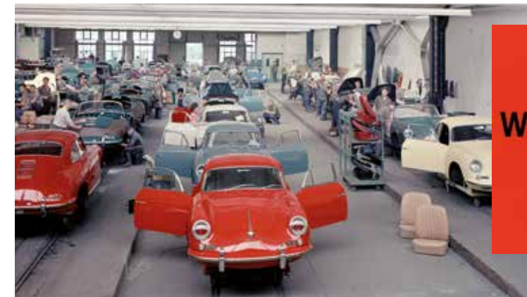
Our first ads under a new name.

Did you know that in 1950, the body and interior of the first Porsche 356 sports car was built at the first Reutter plant? In 1963, Reutter sold its second bodywork plant in Stuttgart's Zuffenhausen district to Porsche, and began focusing on its core business of seating under a new name – RECARO.