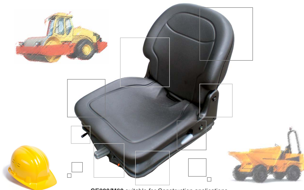
CE200/M60 suitable for Construction applications.